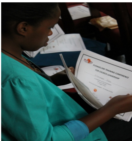
Photo 1: A local evangelist receiving a Mission Africa certificate after a School of Evangelism