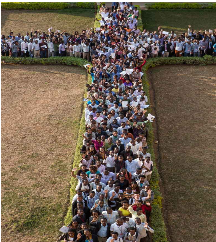
Photo 5: In 2014, over 500 students from different universities in Rwanda were trained in Evangelism