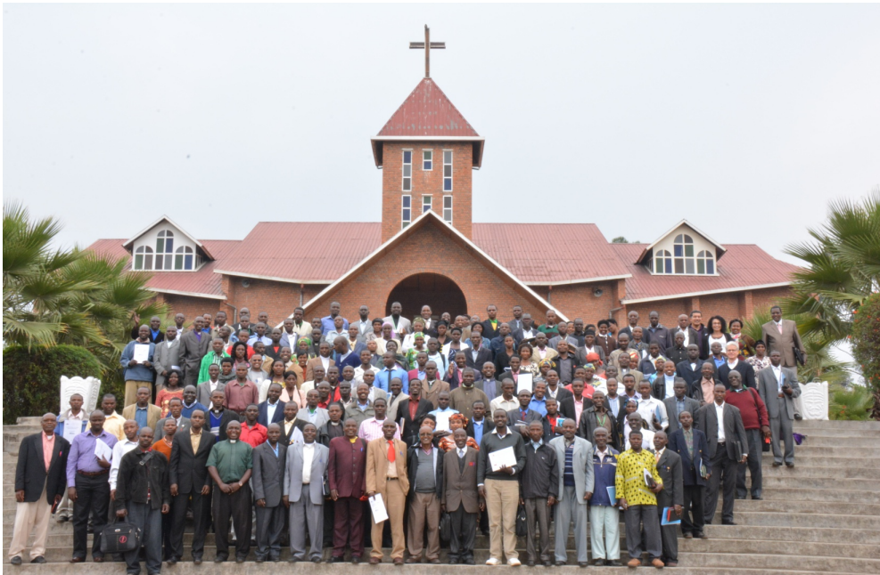
Photo 4: A group of Pastors and Evangelists were trained in Musanze (2013)