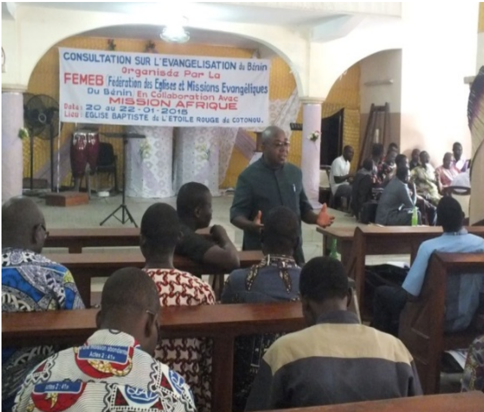
Mission Africa Consultation in Benin 201