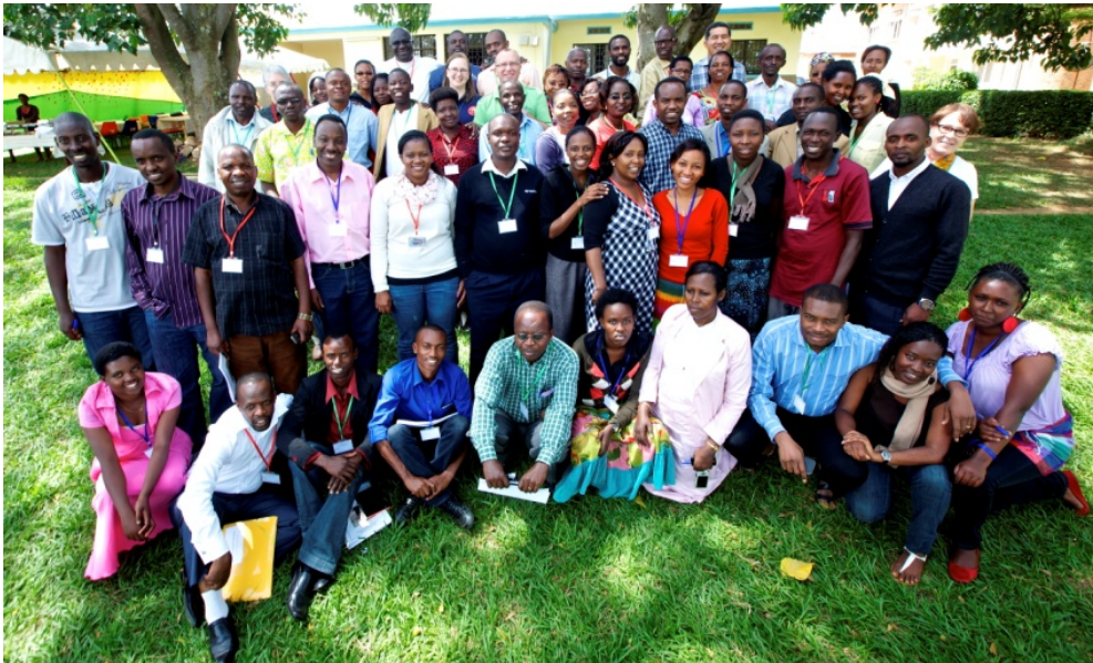
Mission Africa Children Evangelism Summit in Kigali Rwanda