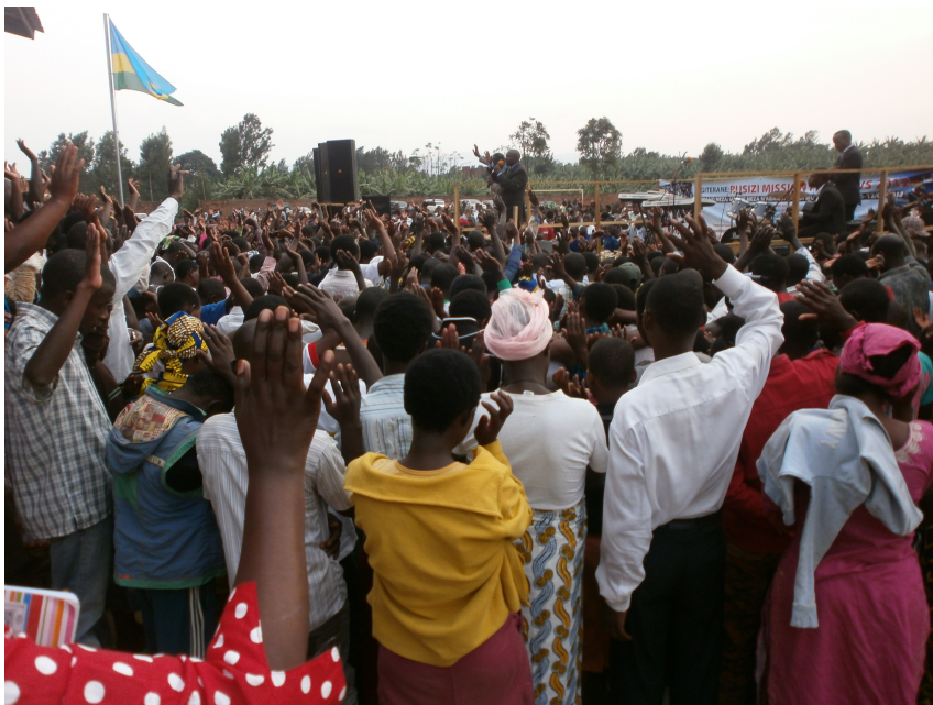
Many people were reached by the gospel